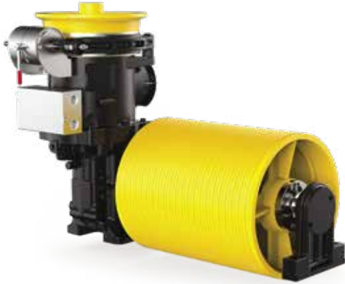
Geared machine Lh